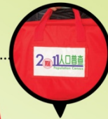
印有人口普查徽號的 紅色文件袋 Red Satchel with the Census Logo

於面談訪問階段（7月16日至8月2日），統計員會登門訪問尚未自行遞交問卷的住戶。 請提供準確資料，搜集所得的個人或個別住戶資料，均會嚴加保密。