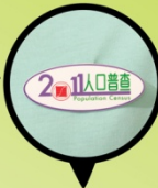
人口普查襟章 Census Badge

紫領綠色制服 背面印有「人口普查」字樣 Green uniform with purple collar "Population Census" printed at the back