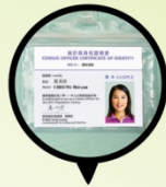
統計員身份證明書 Census Officer Certificate of Identity